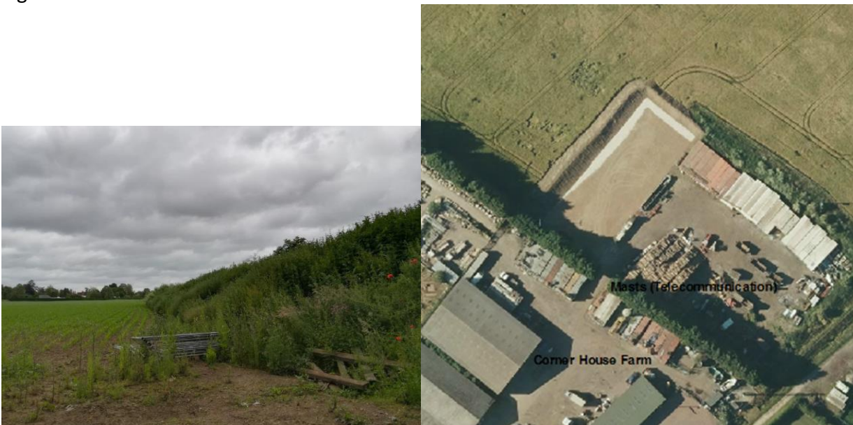
Figure 4 & 5

D. Remove all hard-surfacing and road planings from the ground, and return the land to its former agricultural condition as shown in Figure 6.